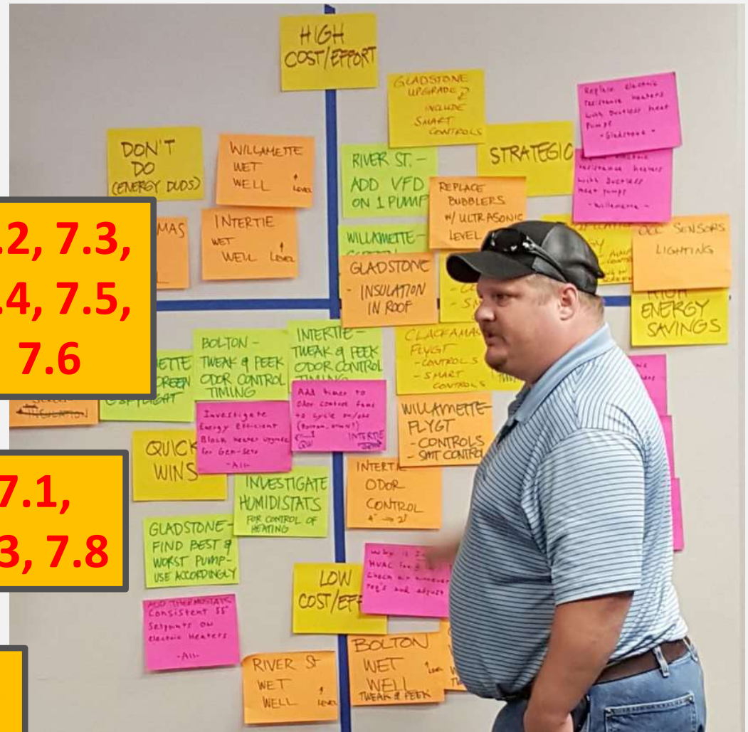
SEM Participant Prioritizing Energy-saving Opportunities