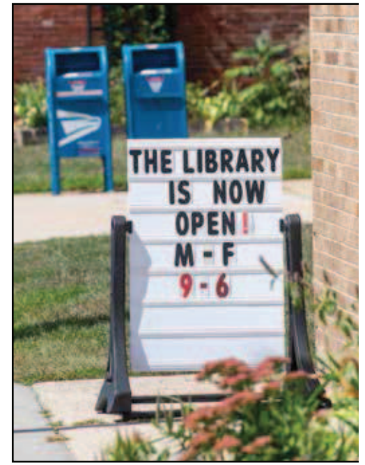
A sign shows current hours of operation at the Willimantic Public Library.

Follow Claire Galvin on Twitter - @ CGalvinTC.