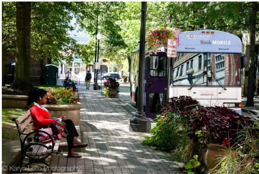
McLevy Green, Downtown Bridgeport

Friday, March 6, 2020 | 9:00 am - Networking Breakfast, 9:30-11:30 am - Program CT Main Street Center Headquarters, Eversource, 410 Sheldon Street, Hartford CT 06106